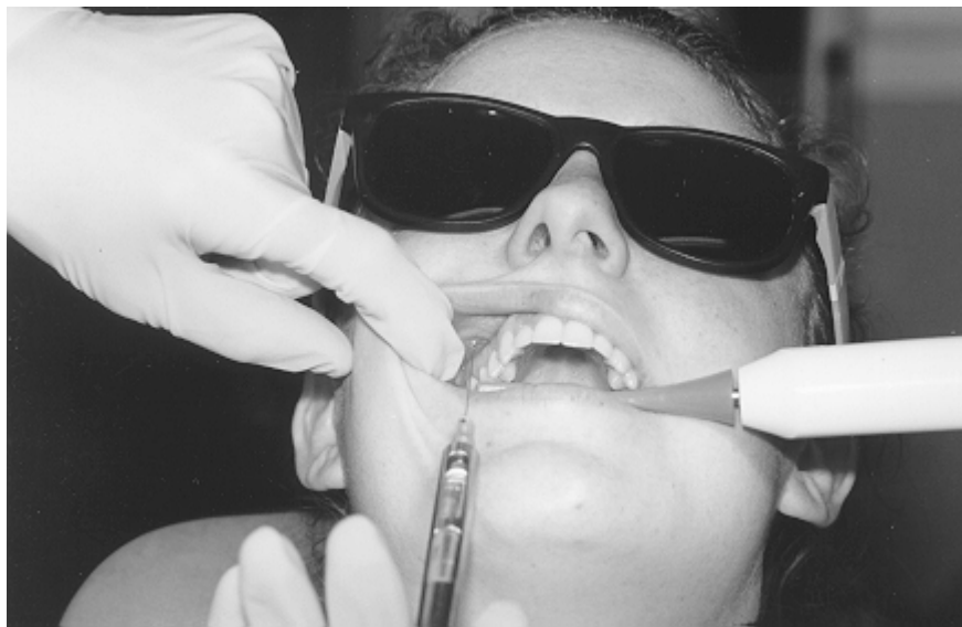
Biting on the brush-head coming in from the other side of the mouth for an infiltration on the right side.

NOTE: Especially with Special Needs patients a mirror may be preferable to a finger for retracting the lip or cheek.